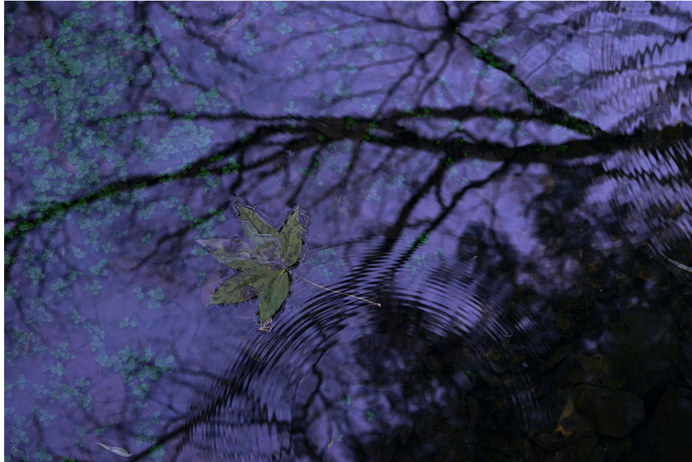
Alpine Stream , 2023, photograph